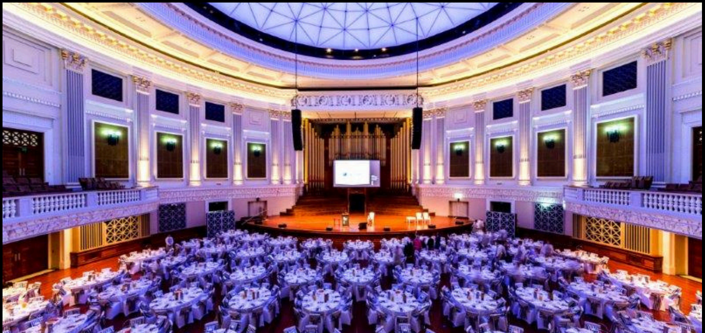
Brisbane City Hall Auditorium