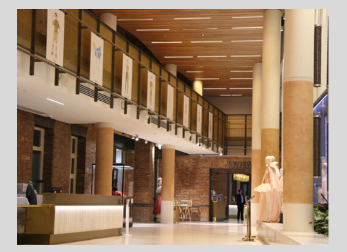
The Promenade – Thomas Dixon Centre xBURO