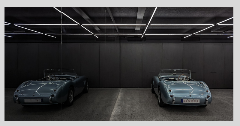
The Langham Gold Coast FPOV