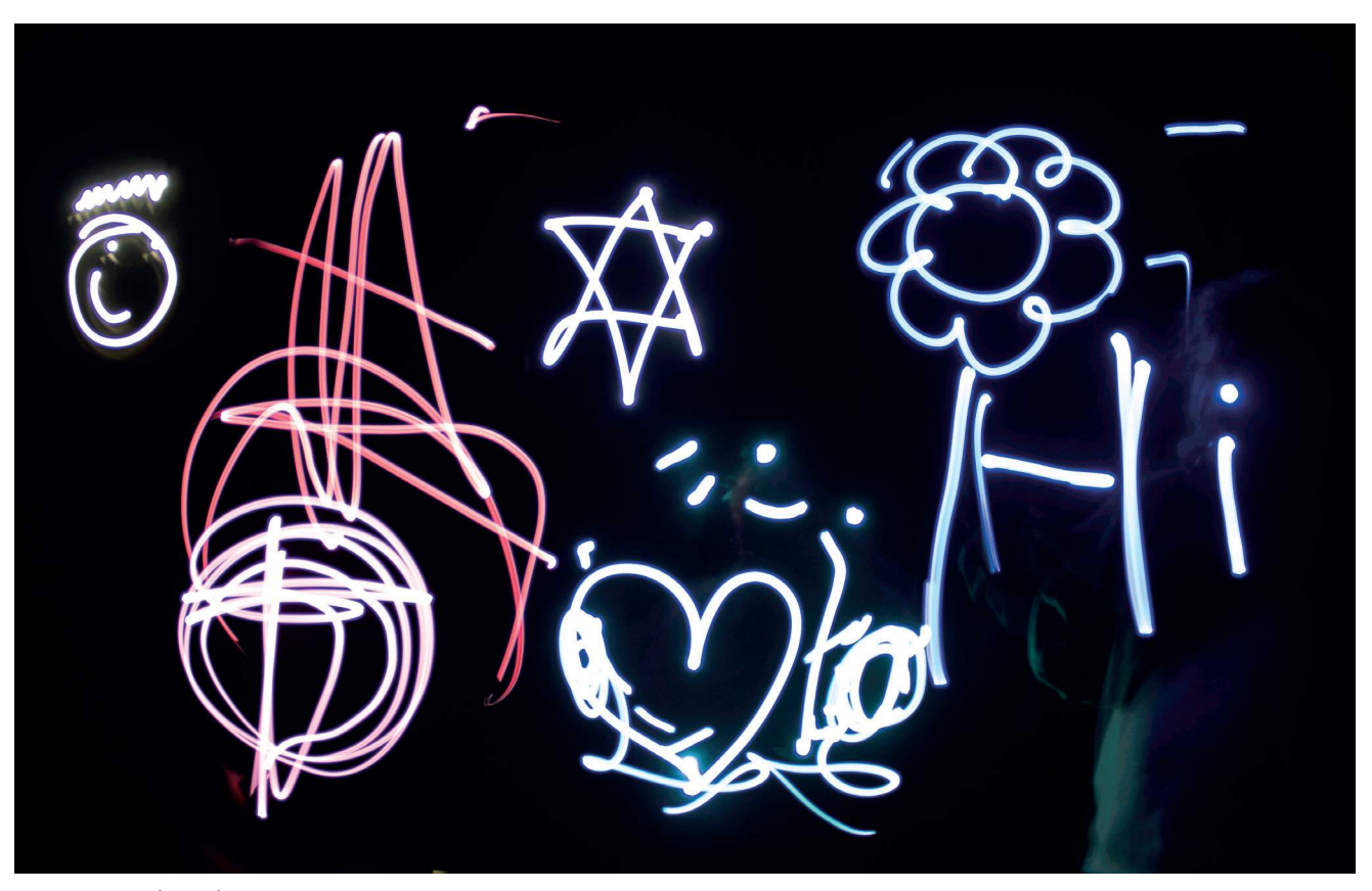
Painting with Light Activity