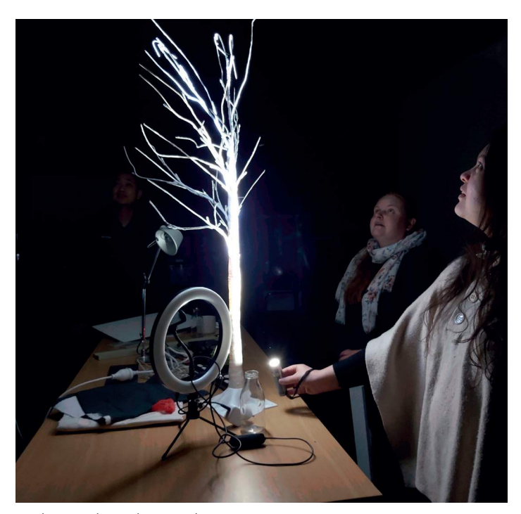
Light, Dark and Revealing Form Activity