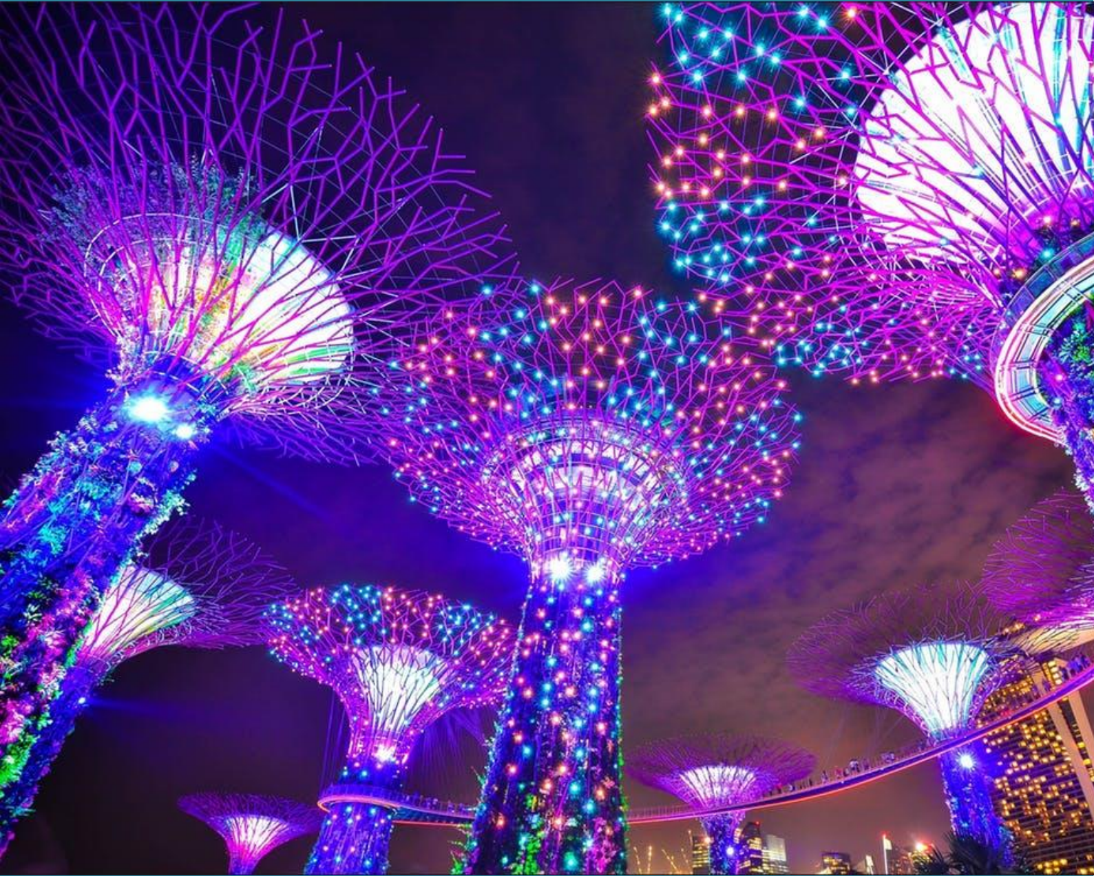
Gardens by the Bay – Singapore: Image - Pexels